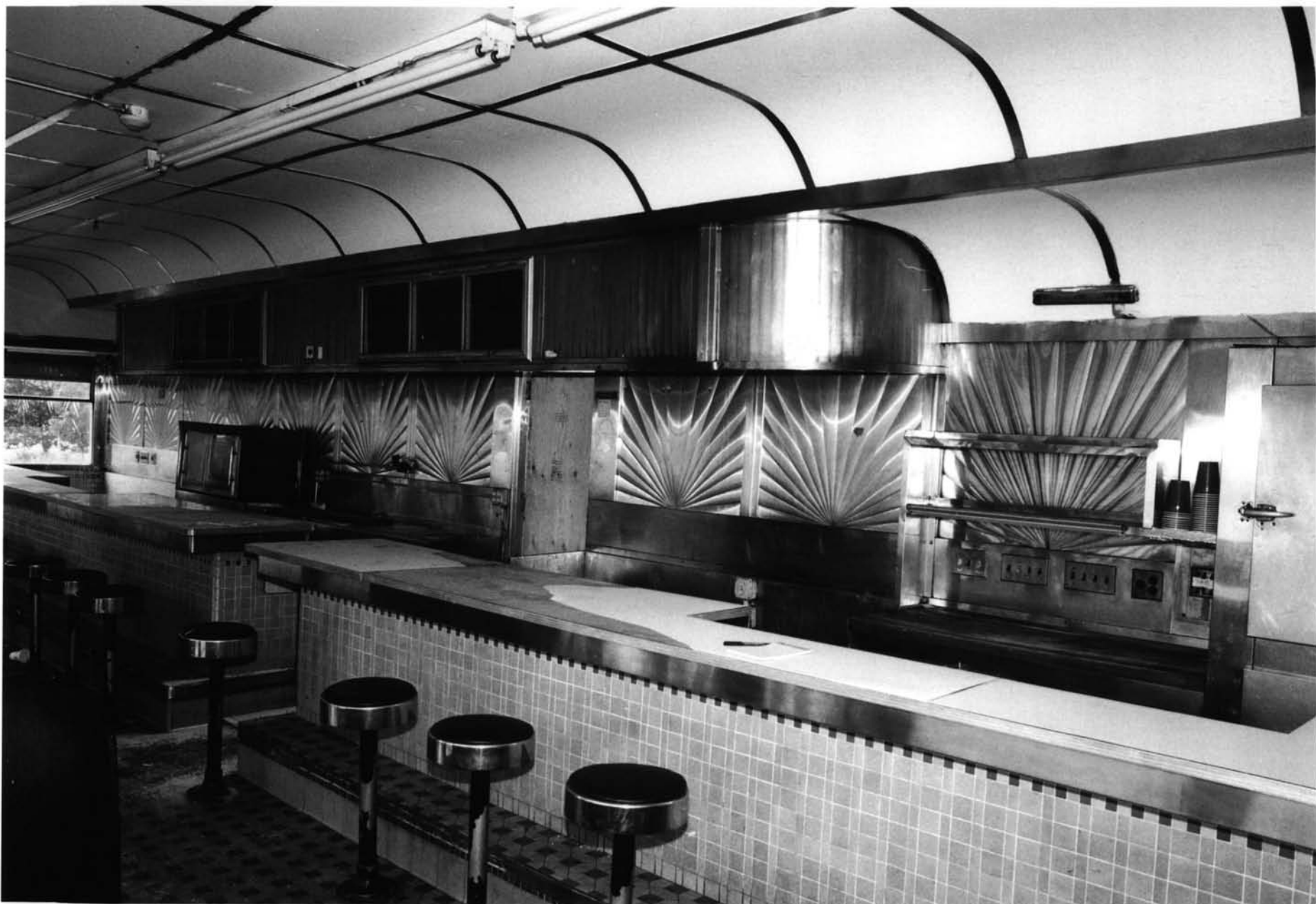
Poirier's Diner Providence County, Providence, R.I. Photo # 5 of 6