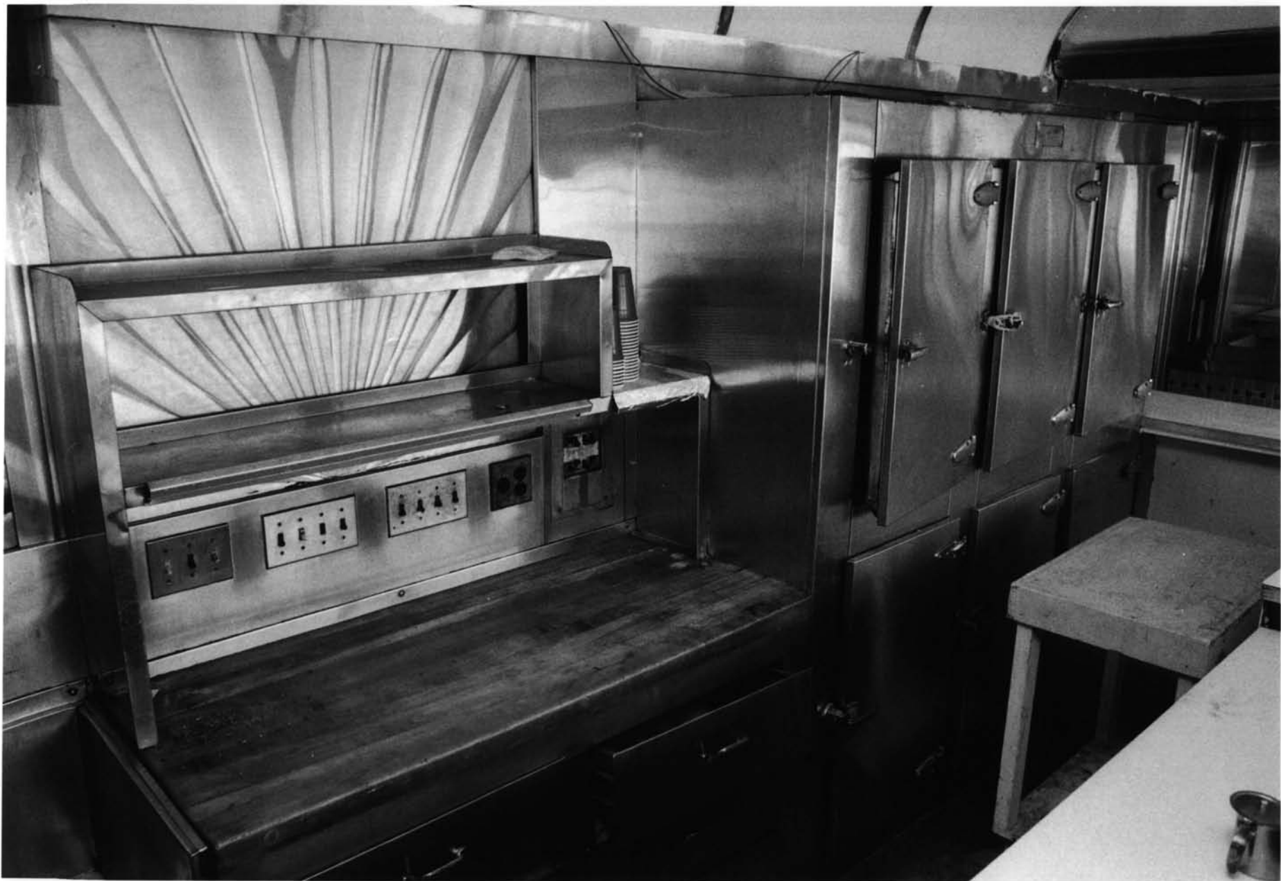
Pairier's Diner Providence County, Providence, RI Photo# 6 of 6