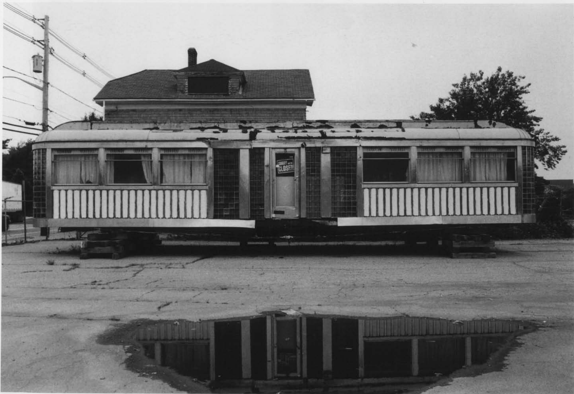
Poirier's Diner Providence County Providence, RI Photo #2 of 6