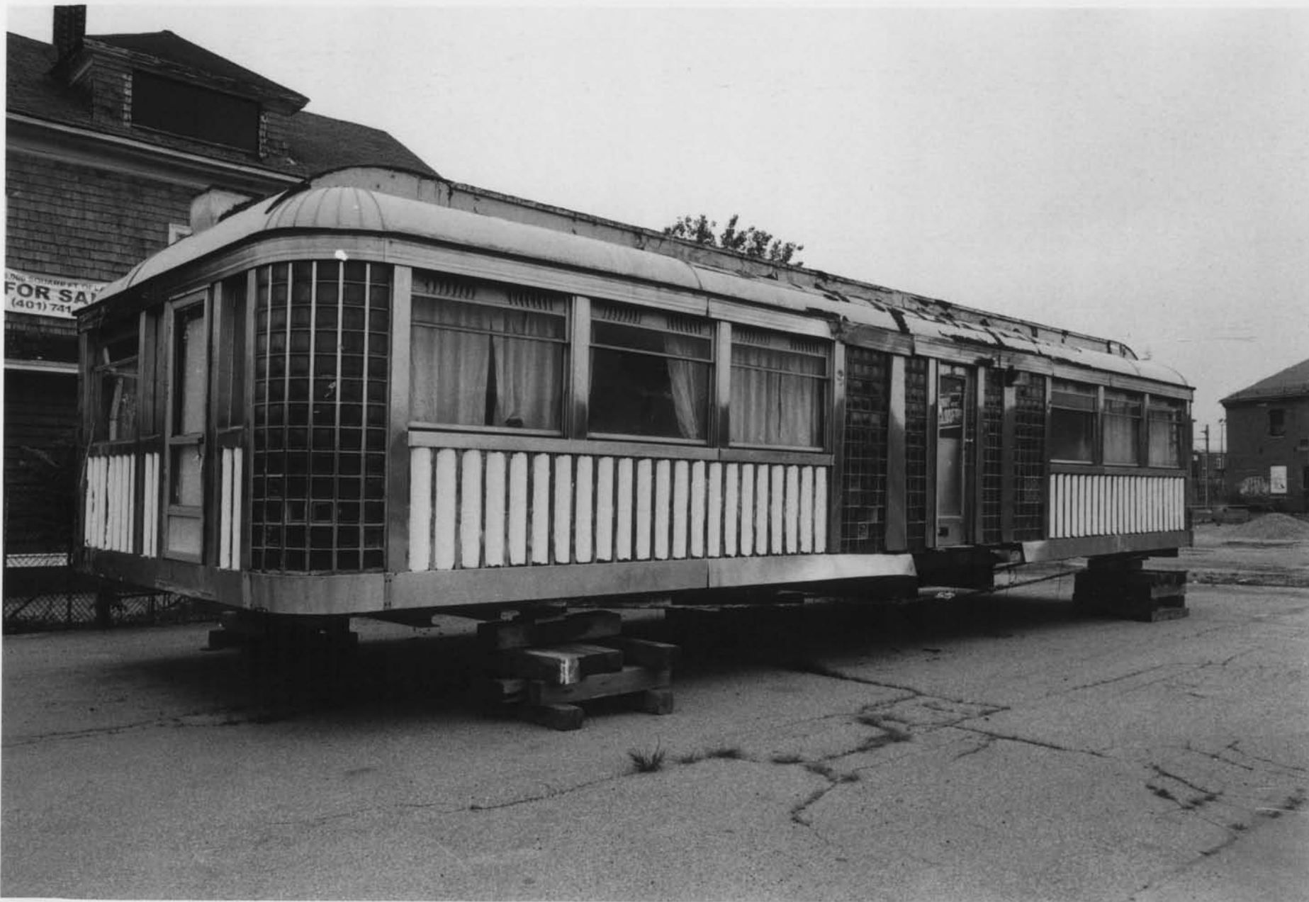
Poirier's Diner Providence County, Providence, RI Photo # 1 of 6