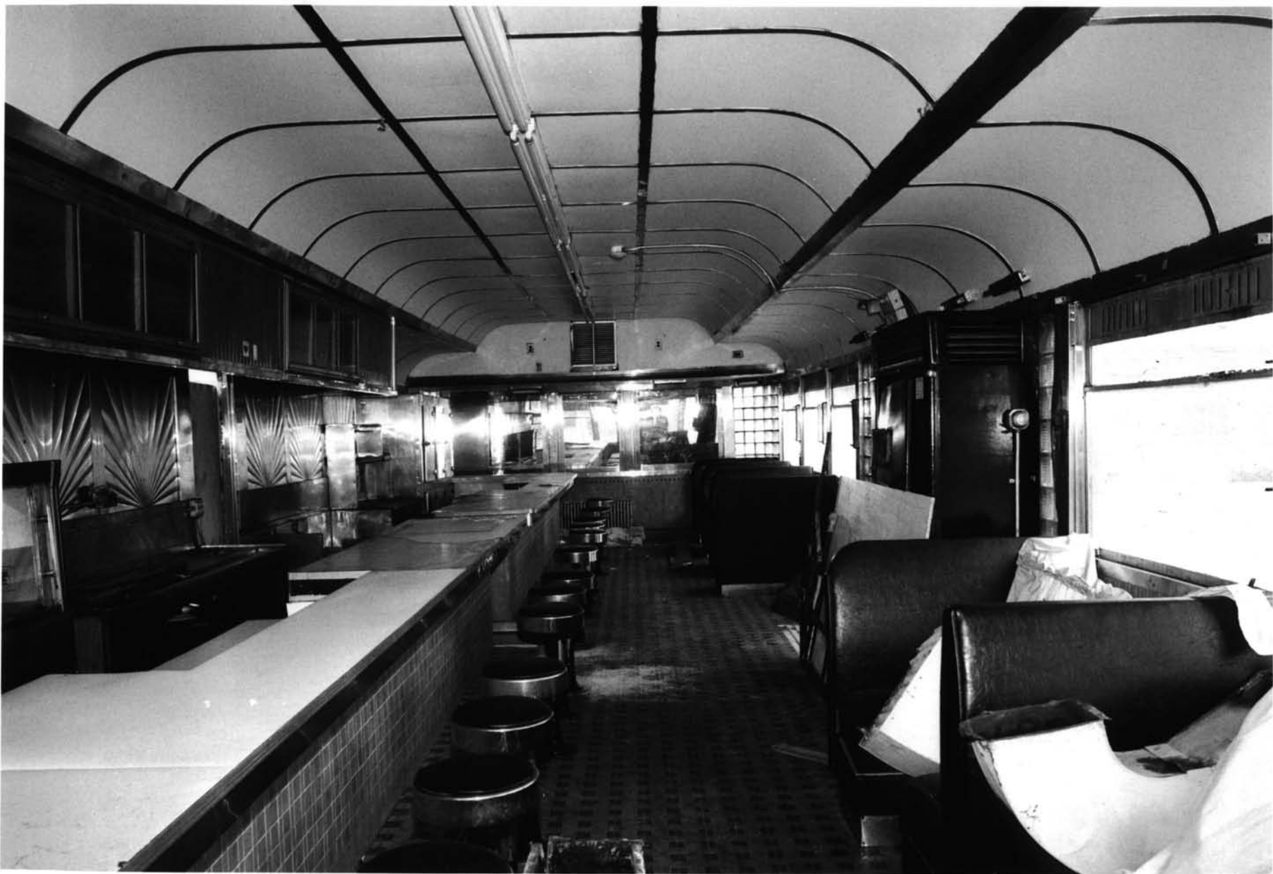
Poirier's Diner Providence County, Providence, RI Photo # 3 of 6