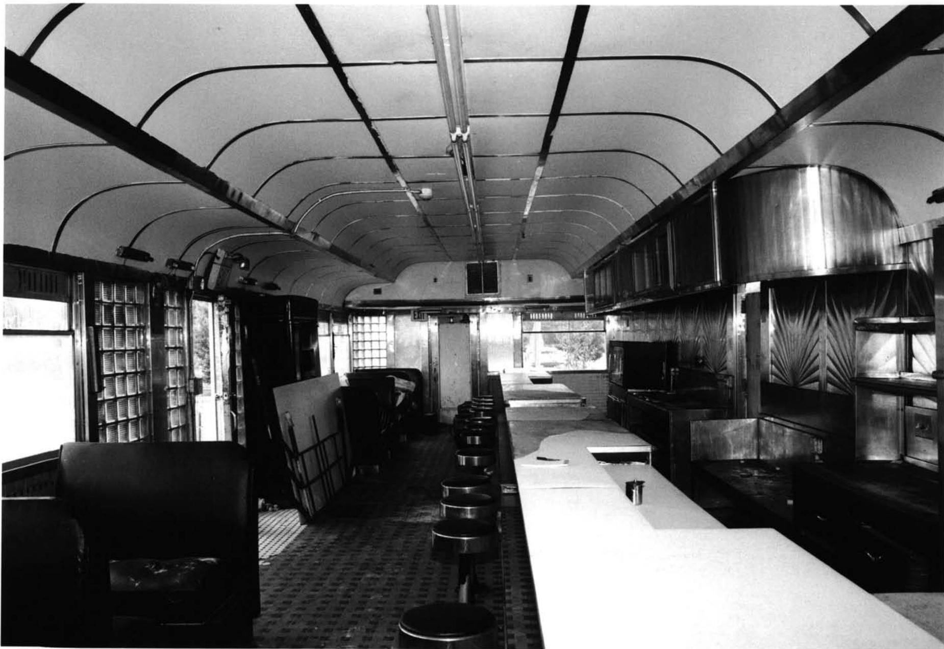
Poirier's Diner Providence County, Providence, RI Photo # 4 of 6